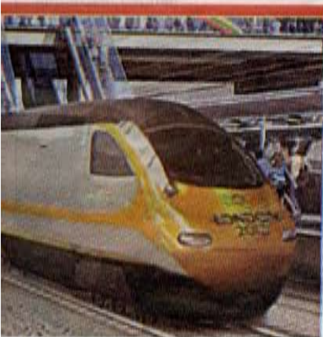
crowding fears: Stratford station may not cope