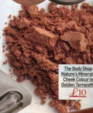
The Body Shop Nature's Minerals Cheek Colour in Golden Terracotta £10