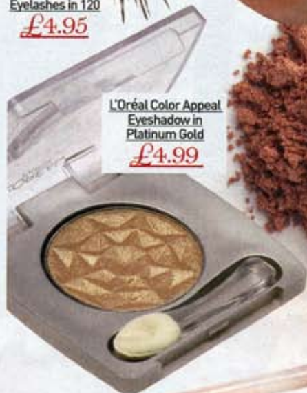
L'Oréal Color Appeal Eyeshadow in Platinum Gold £4.99