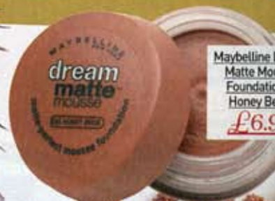
Maybelline Dream Matte Mousse Foundation in Honey Bees £6.99