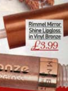
Rimmel Mirror Shine Lipgloss in Vinyl Bronze £3.99

TOP TIP Before applying false eyelashes, use a dark eyeliner along your upper lash line to conceal the band and make your peepers look even bigger