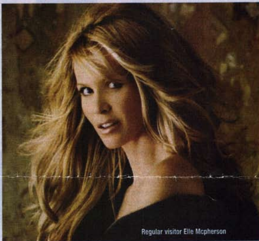
Regular visitor Elle Mcpherson

The Nora Bode Beauty-Tox Ultra Treatment is now applied to the skin and, using pure pulsed oxygen pressure, is transported deep into its basal layers.