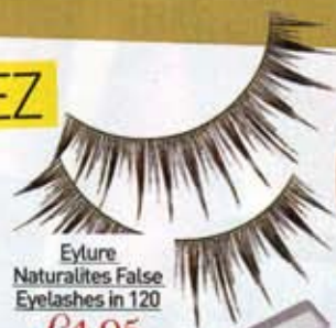
Eylure Naturalites False Eyelashes in 120 £4.95

1 To achieve Jennifer's smooth and even-looking skin, apply Maybelline Dream Matte Mousse Foundation. It will leave your complexion looking natural and radiant all day long. Then, accentuate your cheeks by using The Body Shop Nature's Minerals Cheek Colour: The Golden Terracotta shade will give you a real J-glow! 2 Try L'Oréal Color Appeal Eyeshadow in Platinum Gold. The metallic colour brightens eyes and makes them appear wider. Finish off the glamorous look by applying Eylure Naturalites False Eyelashes in 120. 3 J.Lo keeps her lips simple, but has a hint of sparkle. Rimmel Mirror Shine Lipgloss in Vinyl Bronze is perfect for getting this glamorous look.