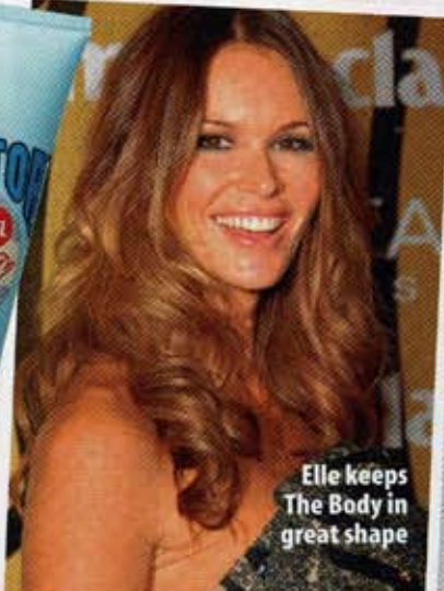
Elle keeps The Body in great shape